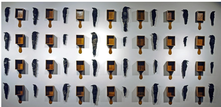
Glen S'kein, Object-poem II all things I could have told you about birds 2012

Look around the exhibition for this artwork below.