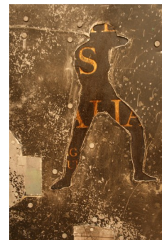
Readers Digest Atlas of Australia Vol. 1 - 6 2 of a series of 6 2012 Mixed Media

Despite the possibility for sentimentality associated with the images and iconography that Glen works with, there is little room for nostalgia; rather there is something disquieting in the way he obliterates elements of the past with slashes of red ink, roughly hewn sutures of thread, or opaque layers of encaustic.