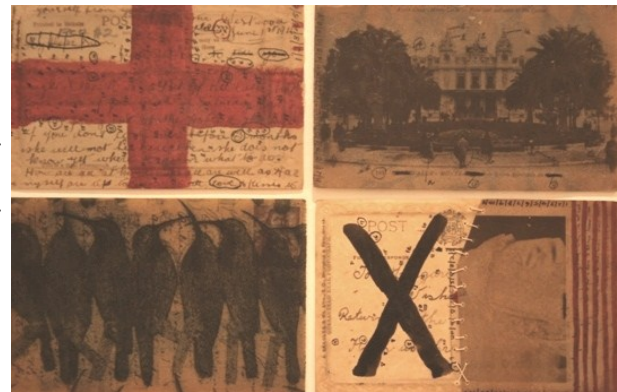
Constellations 1 (detail) 2013

"The past is foreign and historical understanding is not so much a recovery of the past as a mediation between our sense of ourselves and our sense of the past."